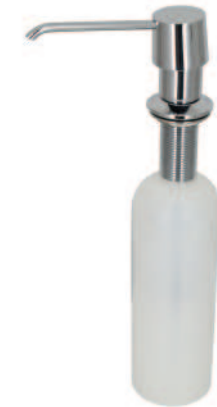
Concealed soap dispenser for countertop Diffuseur de savon à fixer Dosificador de jabon encastre encimera 100114688_N643000034

Instalacion y mantenimiento Installation and maintenance Installation et maintenance